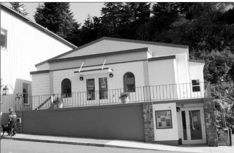
Left: The Arts Council’s newly remodeled home, 2009.

Pleased to see new life breathed into their long-time home at 330 Main Street, the members of Ketchikan’s Christian Science congregation continue to hold services every Sunday at a private residence.