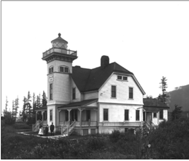
Sentinel Island lighthouse, circa 1905.