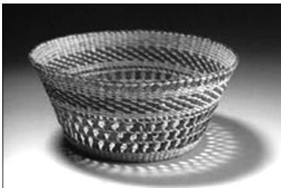
Open weave basket by Diane Douglas-Willard.

Join Haida weaver Diane Douglas-Willard as she instructs weavers of all levels in cedar bark weaving. Students will be introduced to materials preparation and traditional Haida-style weaving techniques. Beginning students will create a rattle-top basket, intermediate students will create a small clam- or seaweed basket, and advanced students will work on projects of their choosing such as false embroidery baskets. This class is a prerequisite for all upper level weaving classes.