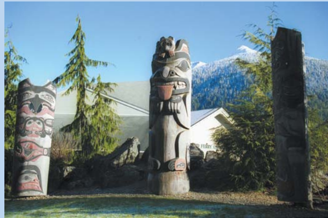
"Council of the Clans" totem pole circle located between the Civic Center and the WestCoast Cape Fox Lodge.