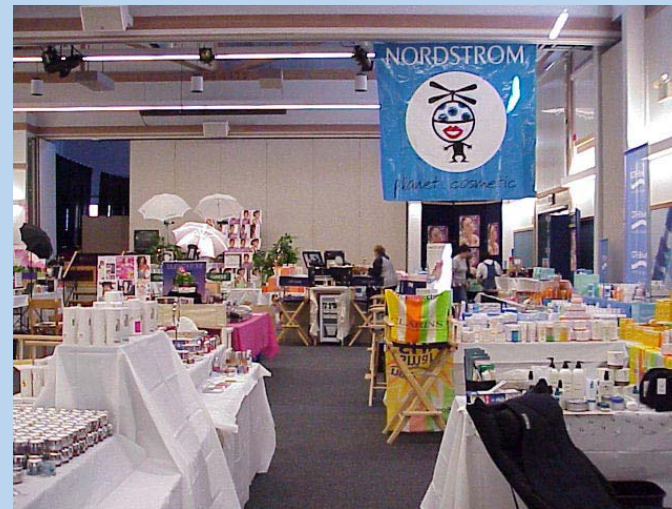
Nordstrom Cosmetic & Fragrance Bi-Annual Trade Show (ballroom)