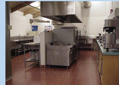
TFCC commercial kitchen

The professional chef will enjoy using our fully-equipped commercial kitchen including china, glassware, silverware and