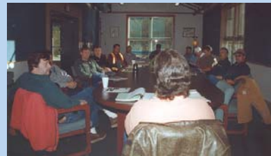
Manzanita Bay Conference Room

The ideal meeting place since opening in 1994, the Ted Ferry Civic Center exemplifies the convergence of Alaskan ruggedness and beauty with modern convenience. Along with high-speed internet access and today's technology in a state-of-the-art, award-winning conference center, we offer our legendary brand of Alaskan hospitality that provides personal service and flexibility comparable to none. It is the perfect setting for a multitude of events – small meetings, retreats, auctions, receptions, banquets, parties, weddings, reunions, conventions, you name it. With a variety of table sizes and seating arrangements available, we can provide the perfect set up for your next event – from very small groups to a maximum of 550 in a theater-style configuration. Just let us know what you want to do and how many attendees you expect, and we'll recommend the best and easiest ways for you to accomplish your goals. Remember, your success is top priority to our staff.