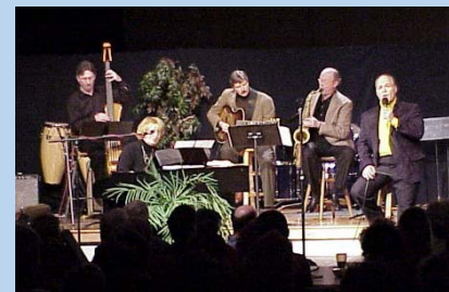
"First City Players" Evening of Cabaret

Each bay has a sound system that can operate independently or in combination with the other bays. We maintain a list of qualified sound and light technicians available for independent hire.