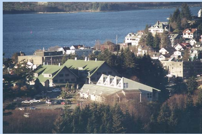
View of Civic Center, WestCoast Cape Fox Lodge and the airport runway across Tongass Narrows.

A complete list of services, equipment, current rates, and rental guidelines are available upon request.