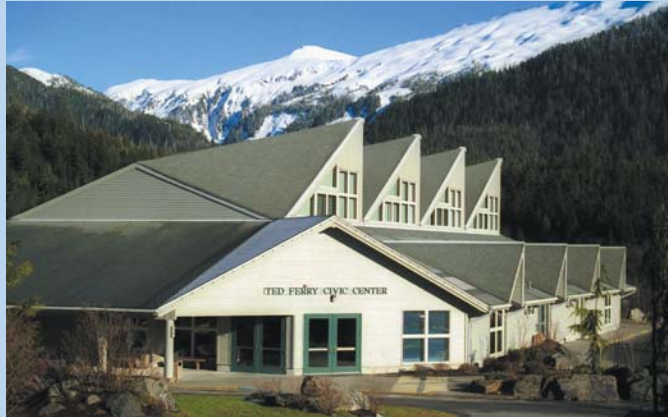
The Ted Ferry Civic Center - Owned & Operated by the City of Ketchikan

The ideal meeting place since opening in 1994, the Ted Ferry Civic Center exemplifies the convergence of Alaskan ruggedness and beauty with modern convenience. Along with high-speed internet access and today's technology in a state-of-the-art, award-winning conference center, we offer our legendary brand of Alaskan hospitality that provides personal service and flexibility comparable to none. It is the perfect setting for a multitude of events – small meetings, retreats, auctions, receptions, banquets, parties, weddings, reunions, conventions, you name it. With a variety of table sizes and seating arrangements available, we can provide the perfect set up for your next event – from very small groups to a maximum of 550 in a theater-style configuration. Just let us know what you want to do and how many attendees you expect, and we'll recommend the best and easiest ways for you to accomplish your goals. Remember, your success is top priority to our staff.